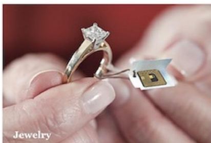
Jewelry Retail Management

RFID Applications are variable. Super Mini Tag will bring us more?