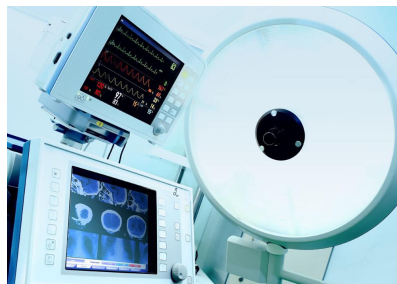
Asset Life Span Management